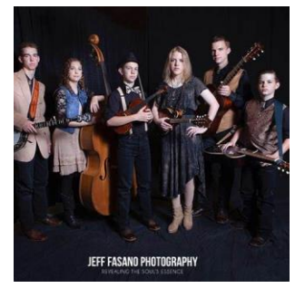
The Family Sowell