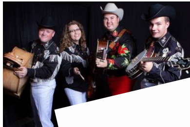
The Kody i

119 West Limestone Rd. Fort Fairfield, Maine 04742